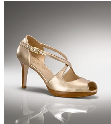
Metallic shoes are very stylish for weddings

Charming embellishments like flowers or bows on the toe of the shoes give them an extra special character. The bride will be on trend with a classic white or ivory silk ballet flat, or she can choose a soft ballet pink shoe for a subtle hint of color. For bridesmaids or wedding guests, a metallic pewter heel with a slight platform and a rounded toe would be the height of fashion and is neutral enough to wear with any color dress.