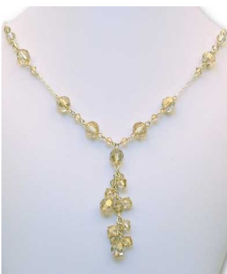
Crystal cluster necklaces are a popular trend

Big jewelry is very popular right now. Take advantage of this trend by choosing wedding jewelry with large baubles, multiple layer necklaces, and mixed chain, pearl, and crystal sets. For the bride, this trend can provide a wonderful inspiration for updating traditional family jewelry. Add a pearl tin cup necklace and a crystal strand to her mom's strand of pearls, and she will have the best of both worlds: wedding jewelry with sentimental meaning and a fresh contemporary flair. Wedding guests can have fun with unique bib necklaces featuring large crystals and pearls (real or faux), and the bridesmaids will look marvelous in chunky Swarovski crystal cluster necklaces.