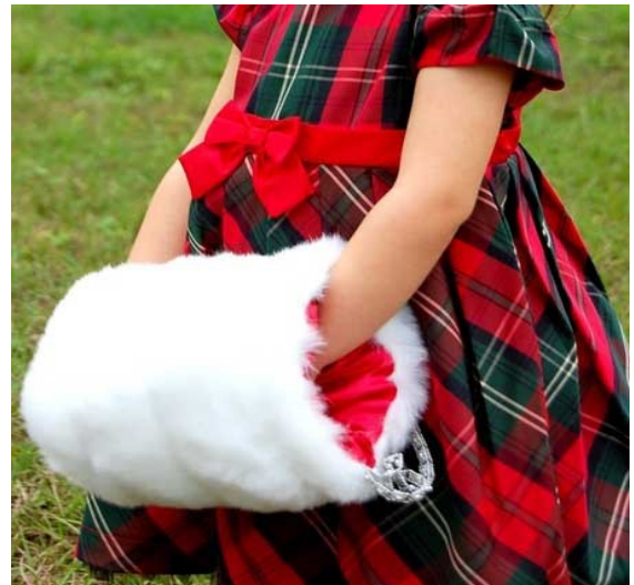
A red and green tartan dress with a fur muff is adorable for a holiday wedding.

Flower girls are so much fun, and you can have even more fun when you plan something special for her to wear and carry. Take advantage of the best that the season has to offer, and be creative. You will find that your flower girl becomes an even more charming part of your wedding.