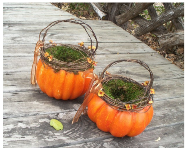
Pumpkin flower girl baskets for an autumn wedding.

Should you be having a Halloween wedding, this is a really cute idea for an older flower girl: instead of a basket or bouquet of flowers, have her carry a tiny pumpkin. Carve your initials or another wedding motif into the jack o'lantern, and light it from within with a battery powered tea light (never a real candle). Dim the lights, and watch her float down the aisle with this most unique flower girl bouquet substitute. It will be something that your guests will never forget.