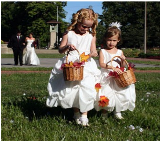
Flower girls tossing fall leaves.

The flower girl is a delightful part of any wedding. You can make her role even more wonderful by tying it in with the season in which you are married. For some of the best ideas for flower girls for fall and winter weddings, read on.