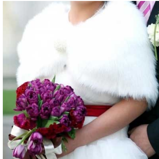
A fabulous fur wrap for a winter bride.

This leads to another point: there are some cases in which the bride is seeking outerwear to get her from car to building and others in which the bride wants a fabulous cover-up that she can wear with her gown, possibly for the entire wedding. If you want outerwear, you might choose a more loose fitting garment, such as an ivory velvet cape (gorgeous for a holiday wedding!). When the wrap is going to be worn during the ceremony, however, it must look as though it is a part of the gown, and not distract from any details on the dress.