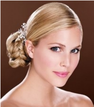
A sophisticated braided bun.

Another option for an updo for a winter wedding is a braided bun. This is a fantastic style for brides who have long hair. The braided bun is romantic and looks wonderful with lace bridal gowns. Having your hair pulled back will allow your wedding jewelry to be better seen. Pearl earrings look lovely with this vintage inspired hairstyle. Finish it off with a scattering of pearl hairpins tucked around the bun.