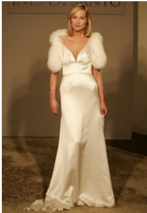
A glamorous fur shrug for a winter bride.

Not all of the current wedding cover ups are sheer. Another trend seen on the runway was long sleeve fitted jackets with peplum waists in solid silk. This style of jacket was layered over gowns with fitted bodices and full skirts. As long as the jacket is fitted through the waist, it can be a very flattering style with an updated vintage flair to it. Textured fabrics were also a popular trend for bridal jackets, ranging from brocade to embroidered silk to pieces with feathers.