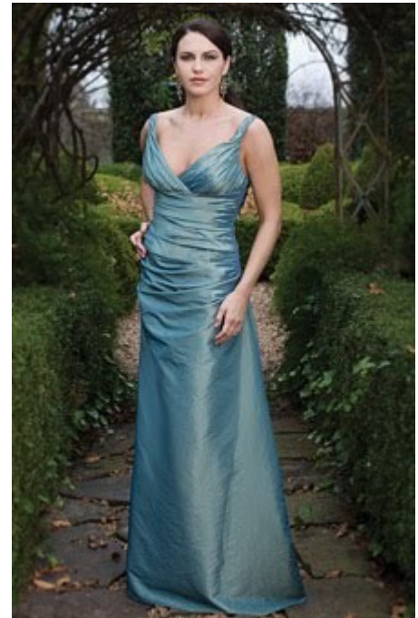
This sophisticated medium blue dress would be gorgeous for a fall or winter wedding.

Blue is not only a very appropriate color for a fall or winter wedding, it is very beautiful as well. Blue dresses are particularly nice when the bride does not want to go with one of the more standard seasonal colors. Timeless and elegant, and always in style, blue bridesmaid dresses would make a wonderful addition to any cold weather wedding.