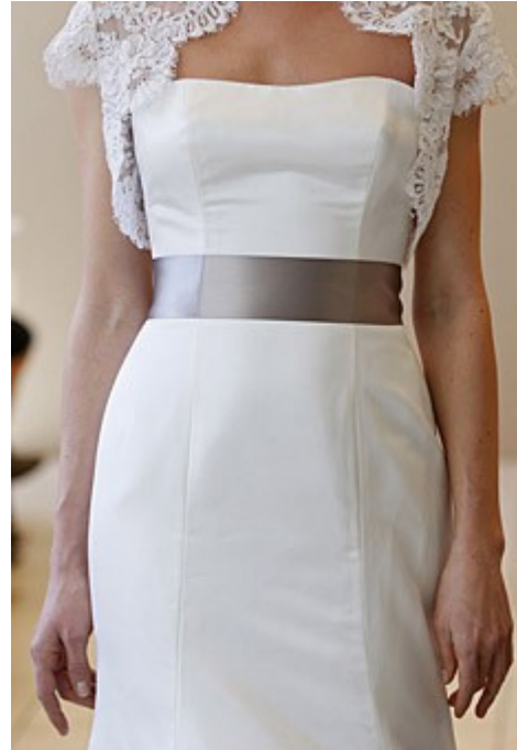
A lace bolero is elegant over a simple bridal gown.

There are many other elegant cover-ups for brides. A delicate white crocheted wrap could fit the bill for a country wedding, whereas a fabulous fur (real or faux, depending on your preference) would add drama and glamor to a Winter Wonderland wedding. With your cozy wrap on hand, you will be snug and happy on your wedding day.