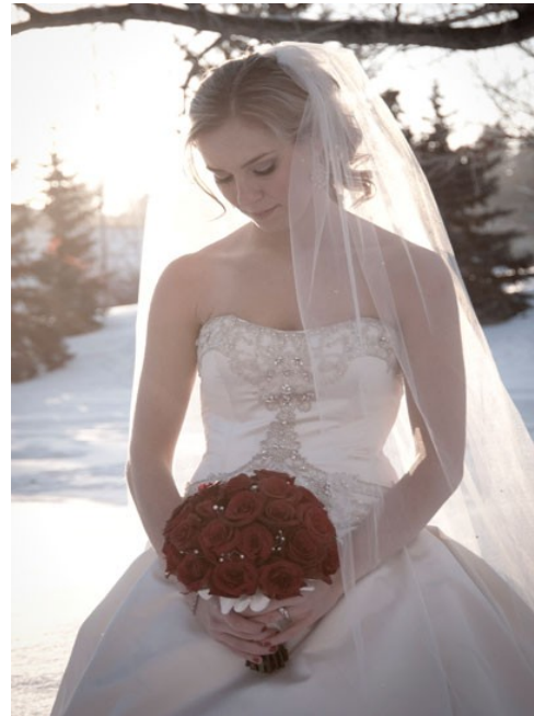
A beaded satin gown is beautiful for a Winter Wonderland bride. Gown by Kenneth Pool.

The bridesmaids for a Winter Wonderland wedding should also look spectacular. As popular as red is for winter weddings, it makes too strong a contrast to the icy white palette that characterizes this theme. Opt for bridesmaid dresses in a color like silver, platinum, or champagne instead. They will look just as festive, yet will not be a distraction from the decor. Certainly the bridesmaids will also want to shimmer. Sets of Swarovski crystal bracelets, earrings, and necklaces would be the perfect finishing touch, perhaps created in the colors of their dresses.